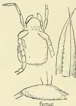
Labidura electrina , sp. n.